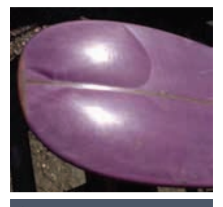
▲ Bubble trouble: Surface layer delamination caused by thermal expansion of EPS. ▼ Pressure relief: A Gore ePTFE vent is open to air; closed to water, salt, and sand.

Designers have tried to solve the problem